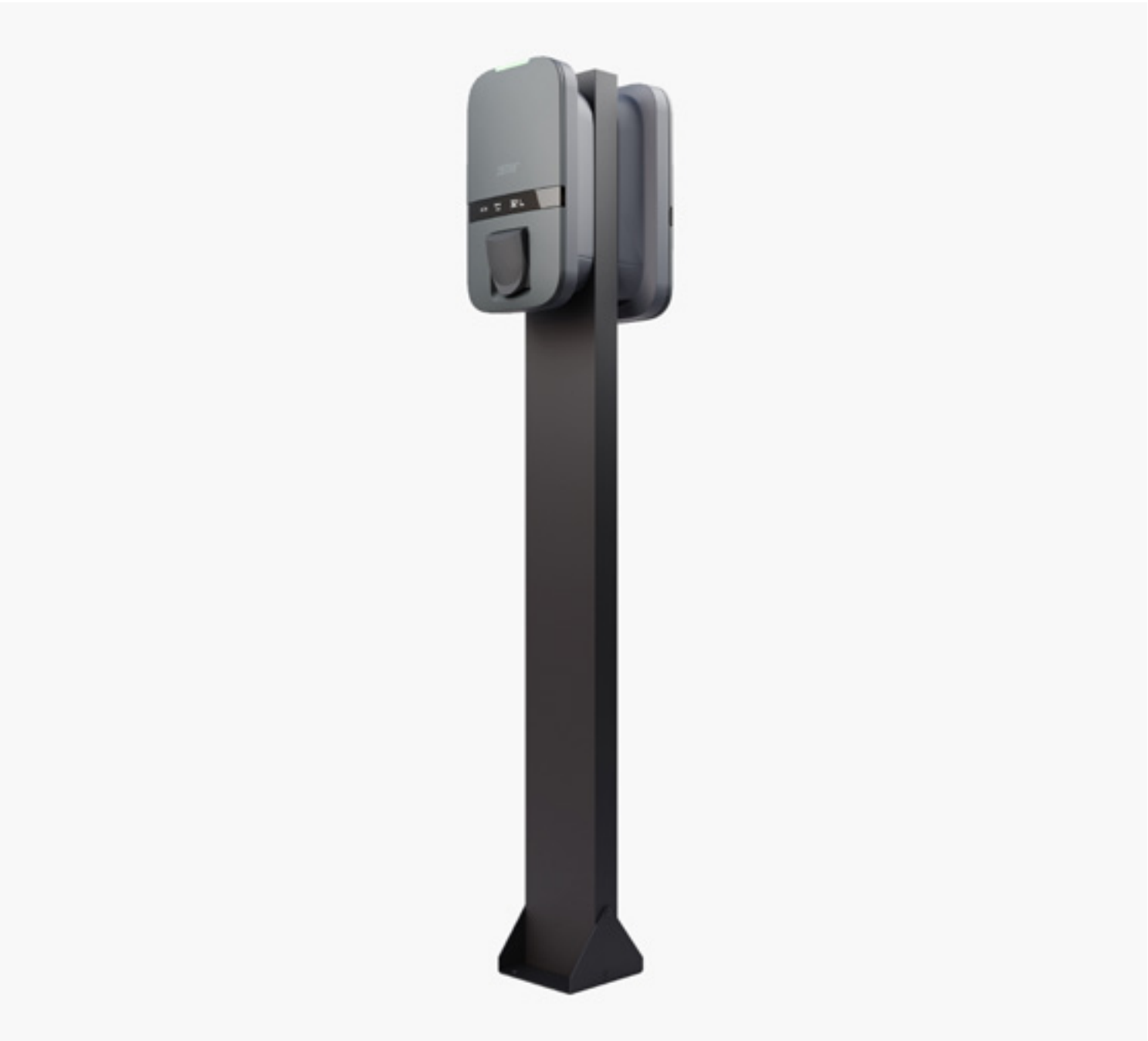
Single and dual pole

Built for stability, our Pole Base supports both single and dual Peblar poles in any setting. Quick to install and built to last—giving your setup the professional finish it deserves.